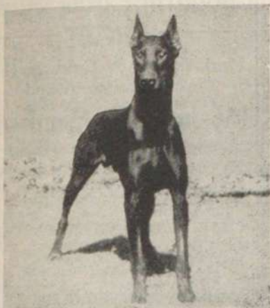
Ch. Cognac v. Glenhugel