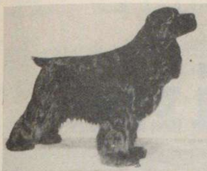
CH. STOCKDALE RITZIE Planning Your Vacation? Let Your Dogs Holiday at SANBORN'S Boarding Kennel Rates on Request