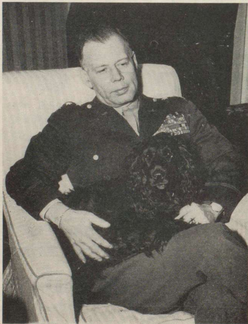
Lt. Gen. Walter Bedell Smith, U.S. Ambassador to Russia, with his Spaniel. "A Pair of Good-Will Ambassadors"

Championship, and is the first International Champion Skye (American-Canadian) in America.