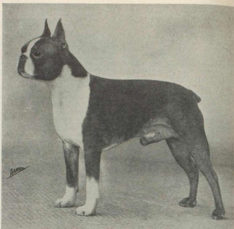
INT. CH. SAINTS REST DOUBLE ACE

The Boston Terrier is a man-made breed. It was started in and around Boston, Mass., prior to 1893, and it was in 1893 that the breed was officially recognized. Up to 1903 a total of 13 champions were crowned. In the next ten years there were 93 champions. From 1913 to 1923 there were 129 champions. It was about this point that the Boston became very popular, and led in registrations for several years. From 1923 to 1933 there