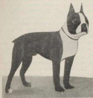
Paddys Best Regards