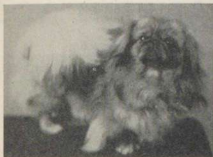
PIER'S RED SHO DEE OF FERNRAY 15 Months Old

Best of Winners, Pekingese Specialty, Seattle, U.S.A. 5 points January 27th.