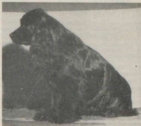
Alberta's Dixie Belle