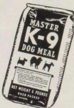
For Puppies and Grown Dogs

"Pointers from Smaland's Kennels are bred for the hunting field and this kennel usually has entries at trials held in Ontario. Such dogs must have stamina so they are fed to produce staying power. So, when I recommend MASTER K-9 Meal as food for growing puppies I do so with confidence that it will produce desired results. I know, too, that this dog food is favored by other breeders and trainers of trial and hunting dogs."