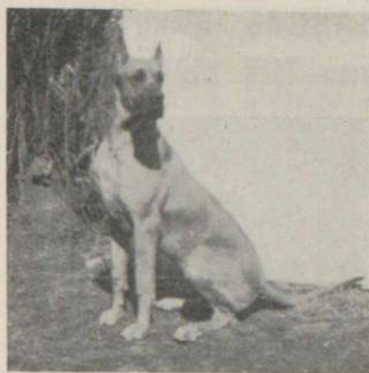
FINGARD'S SIMBA II