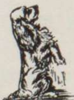
"Every Dog Loves its Master"

Write to TORONTO ELEVATORS LIMITED for FREE BOOKLET, "The Dog's Life".