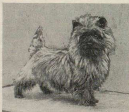
MERRY MEG OF MELITA