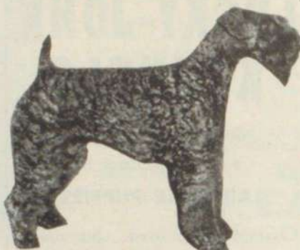
CHAMPION BALLYHOO OF ORR-MUR

For really outstanding championship stock, quality and service, look to Mayvic Kennels, the home of champions.