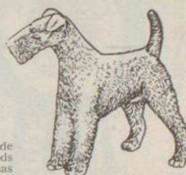
WIRE FOX TERRIER

Such is the excellent quality of these brooches that we can make with pride the statement that out of the very large numbers already sold under our "goods satisfactory or money returned in full" guarantee, NOT ONE brooch has been returned.