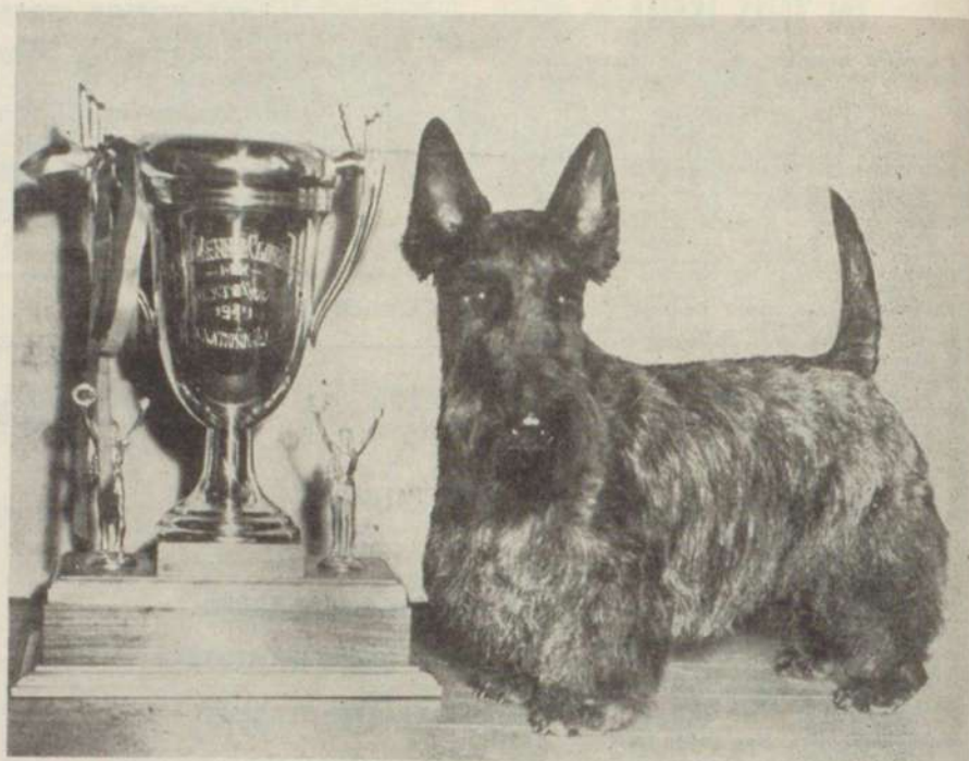
CH. GLENARBUCK AMBITION

In connection with the subject of prepotency, it should be clearly understood by the livestock breeder that many laws laid down by the geneticist are founded wholly or in part upon observations and experiments upon plants, and that while in the main these rules may be applied to animals, certain reservations must be made. One should remember when dealing with domesticated animals that however pure the ancestry of any individual one may be, there are within that animal, be it sire or dam, characteristics which are hidden and which will appear only in its offspring, so that after all the true value of a breeding animal can only be estimated by the quality and vigour of its offspring. The potential or possible characteristics hidden or contained within the germ of domesticated animals are many and mixed. This is not to be wondered at when one takes into consideration the history of the development of the breed or strain. Many of the breeds of domesticated animals are of comparatively recent origin and the characteristics within their genes or germ plasm are still in a state of flux, not being fixed to anything like