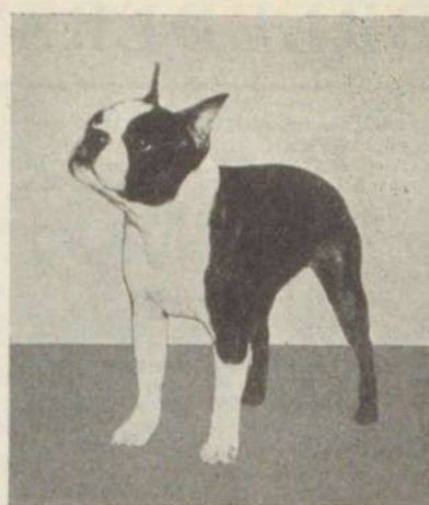
CH. HAGERTY'S MINE ALONE