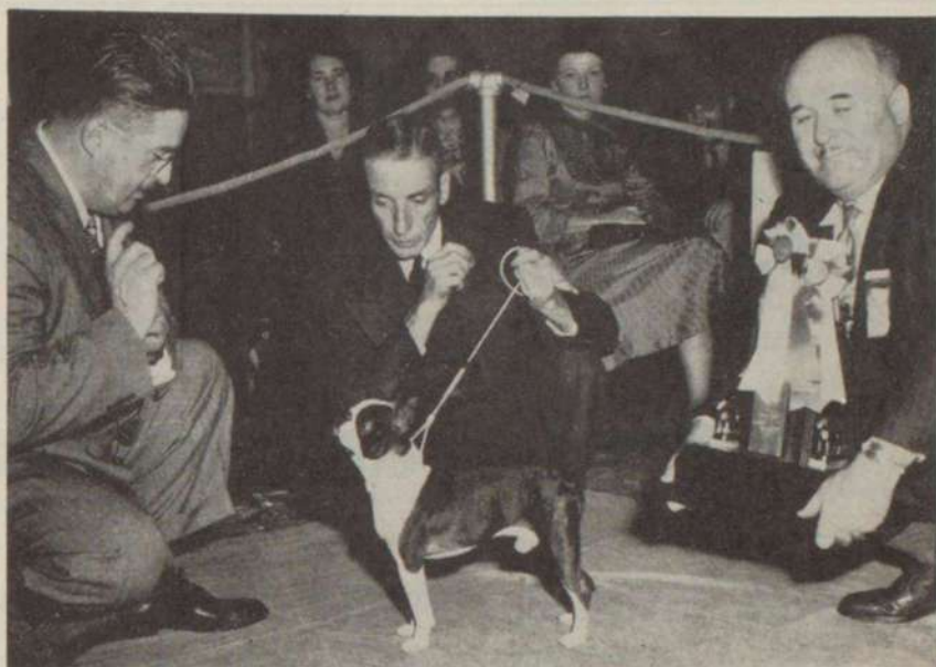
CHAMPION COSBURN'S GALLANT CHUM