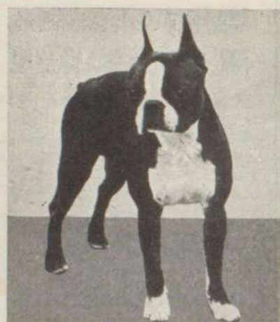
INT. CH. SOVEREIGN'S ESCORT Stud Card on Request