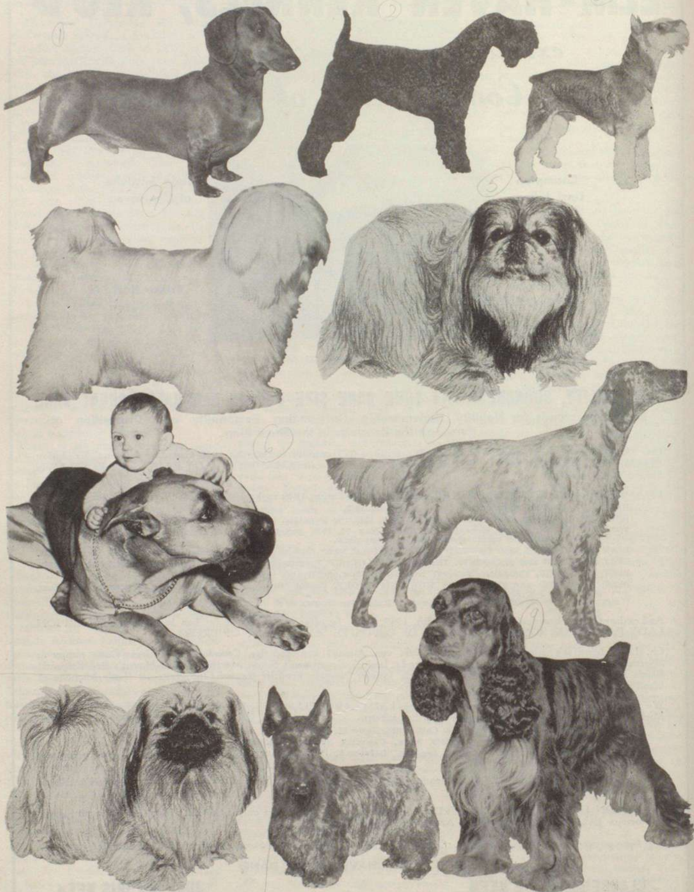
Dachshund, Happy Daze; Kerry Blue Terrier, Kilkenny's Blue Shamus; Schnauzer (Miniature), Benbrook Beau Brummel; Maltese Terrier, Shirlene's Beau Ideal; Pekingese, Tinker Toi's Son Toi; Great Dane, Fingard's Count; English Setter, Rip of Fair Glen; Pekingese, Tinker Toi's Golden Toi; Scottish Terrier, Glenabuck Ambition; Cocker Spaniel, Country Talk of Armcrest.