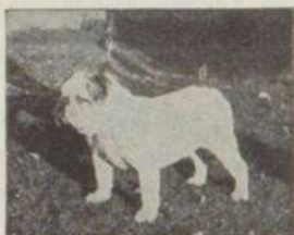
CH. CANNING TOWN TANK (Imp)