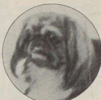
Head Study of the WUN DAH of HONG KONG