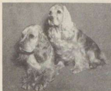
TOMMY and HONEY

We and our owners extend to all Dog Lovers