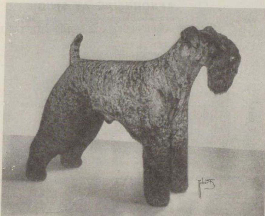
Int. Ch. Kenmare Masterpiece