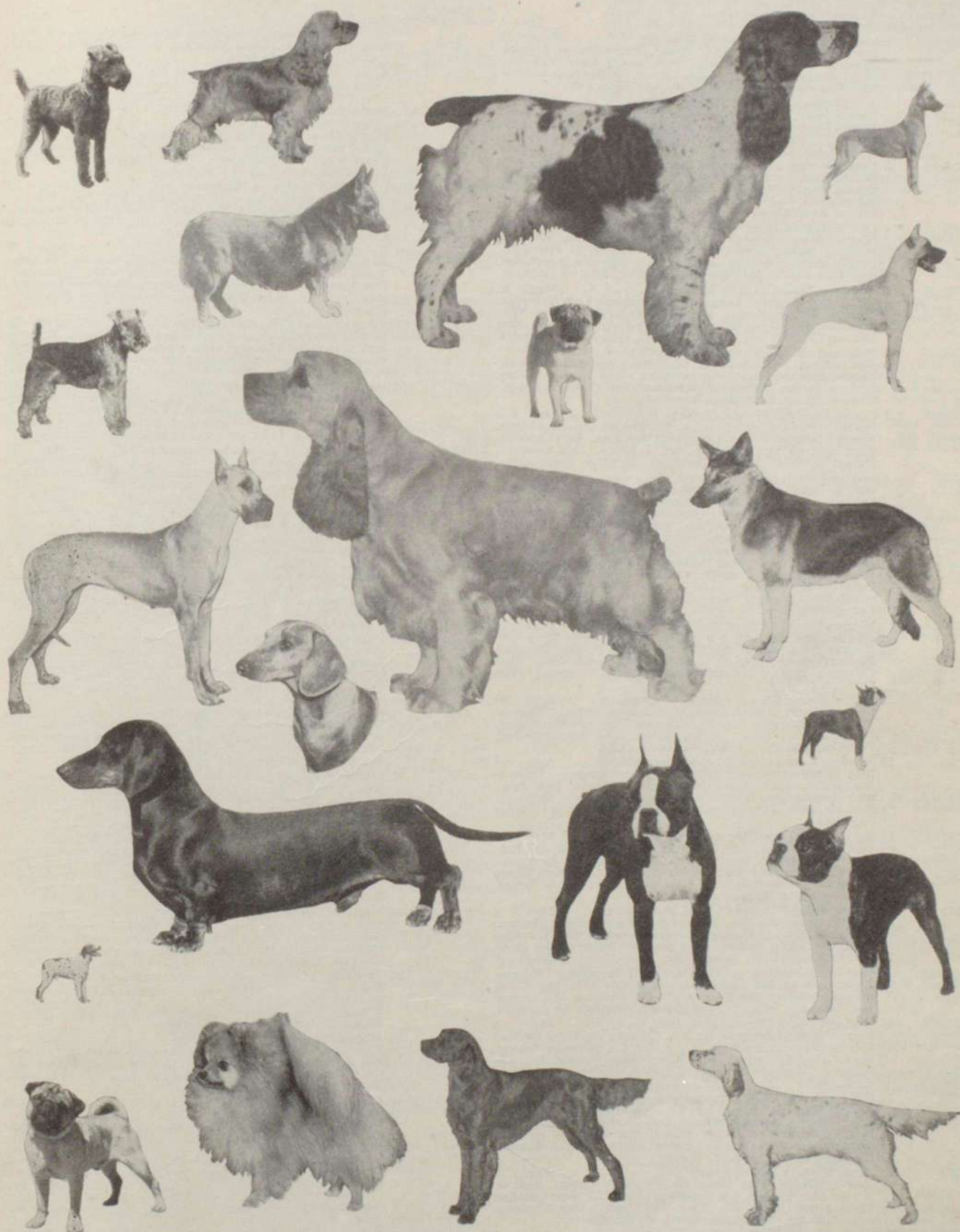
Irish Terrier, Crackle of Cranmore; Cocker Spaniel, Stockdale Gay Caballero; Welsh Corgi (Pembroke, Thanksgiving Grace; Springer Spaniel, Nodnol Lady Patricia; Great Dane, Kindon Lady Typhoon; Welsh Terrier, Monona's Minute Man; Pug, Winna Sir Robin; Great Dane, Page's Lady Margaret Reay; Great Dane, Lady Jennifer of Rurik; Dachshund, Egyptian Maize of Joyce; Cocker Spaniel, Sandon Sweet Clover; German Shepherd, Victoria of Sandorea; Boston Terrier, My Ideal Regardless II; Dachshund, Dachsheim's Tar Baby; Boston Terrier, Sovereign's Escort; Boston Terrier, Ch. Hagerty's Mine Alone; Brittany Spaniel, Duke of Brittany; Pug, Winna Prince Charming; Pomeranian, Golden Glow Dandy; Irish Setter, Lal Larka of Ardee; English Setter, Lady Patricia of Howland.