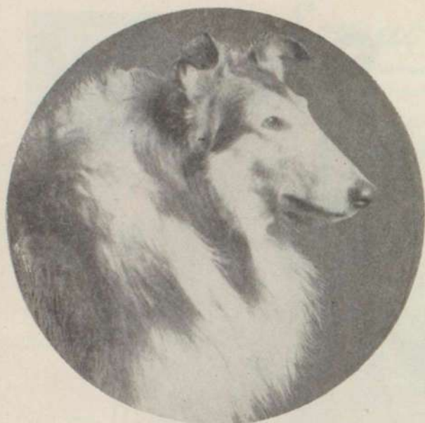
Ch. Elmhill Buddie Boy of Quarrybrae