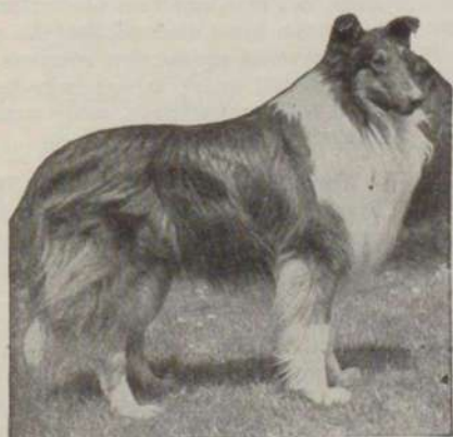
CH. BONACRES PICKWICK Sired by Golden Victory