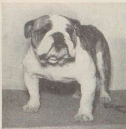
CH. NUGGET TREALOR

BY THEIR FRUITS YE SHALL KNOW THEM There is No Substitute for Good Breeding