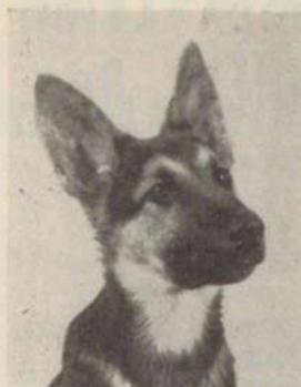
A Sandorea puppy at 4 months