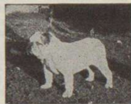
CH. CANNING TOWN TANK (Imp)

Ch. CANNING TOWN TANK placed Best of Breed at Chatham Show, April 15th, 1950, over one of the finest entries of Bulldogs in Canada for a long time.