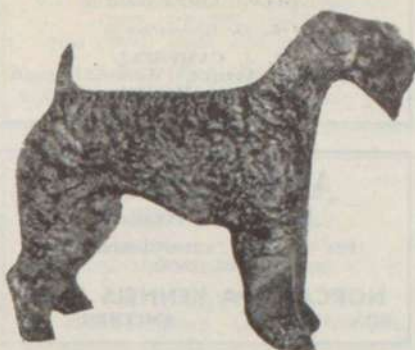
CHAMPION BALLYHOO OF ORR-MUR

For really outstanding championship stock, quality and service, look to Mayvic Kennels, the home of champions.