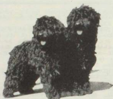
The dog with the funny face and the faithful heart.

We can recommend without reservation, these ragged little fellows of The Kraal. We have stock from the best lines in the U.S., both native and imported.