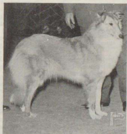
CH. VAN ISLE STARMIST'S BETTY (Collie, Rough) C.K.C. #270703