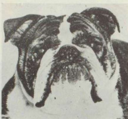
KEYAL'S MR. SLUGGER, A.K.C., N27912