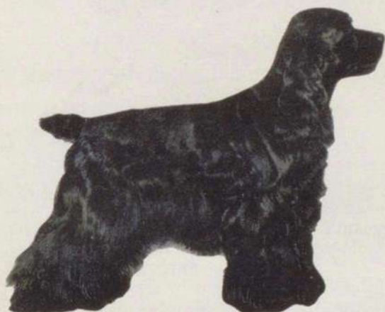
MYROY ABOVE ALL