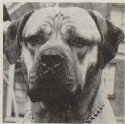
CHAMPION MAJFERN AMBASSADOR (Bull Mastiff) C.K.C. #264609