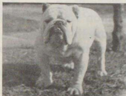
CH. VICTORY TORPEDO CITATION (Bulldog) C.K.C. #283902