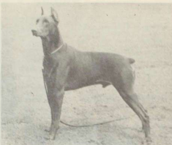
INT. CH. TATJAN OF REKLAW