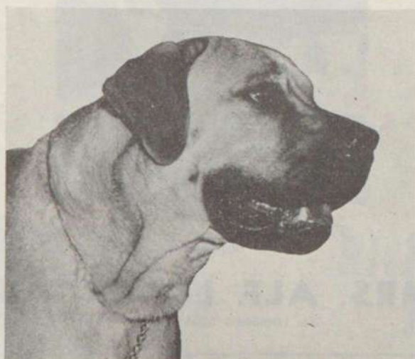
CH. RAVAGER MAJFERN OF THE ROUGE "JOCK"

Pays a last tribute to an outstanding young dog, and regretfully records the loss to the breed of a promising sire.