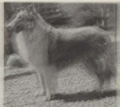
CH. BONACRES VICTORIA

Best in Show All Breeds Provincial at Brandon Also Best Canadian Bred Collie Club Specialty, Guelph