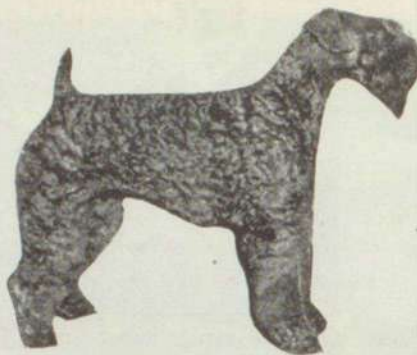
CHAMPION BALLYHOO OF ORR-MUR

For really outstanding championship stock, quality and service, look to Mayvic Kennels, the home of champions.