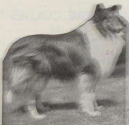
CH. BONACRES PICKWICK