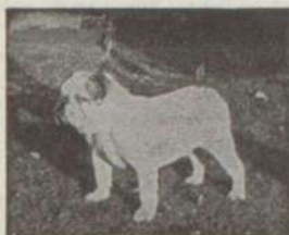
CH. CANNING TOWN TANK At Stud — Fee $35.00