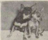
Dogs at Stud