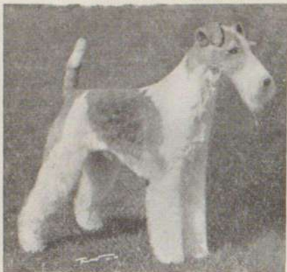
ENG. CH. CASFALA COPYRIGHT