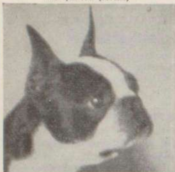
AKC and CKC Reg.