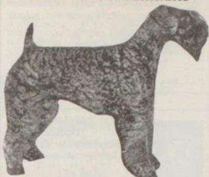
CHAMPION BALLYHOO OF ORR-MUR

For really outstanding championship stock, quality and service, look to Mayvic Kennels, the home of champions.