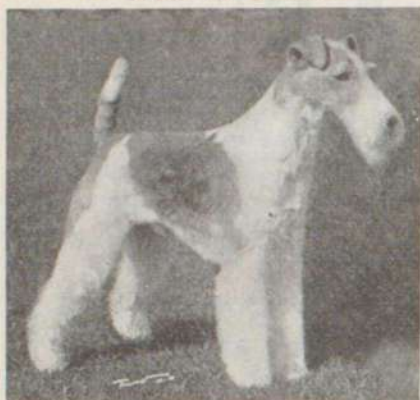
ENG. CH. CASFALA COPYRIGHT