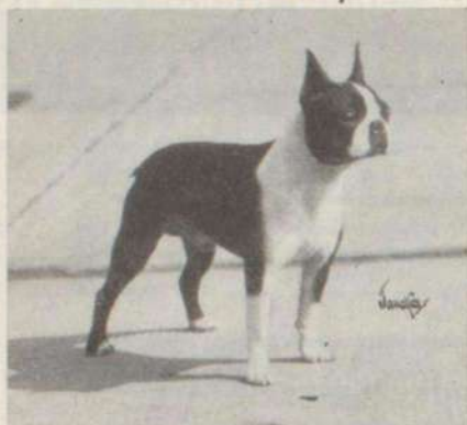
Int. Ch. Showman's Finale Tommy Canuck