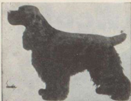
Am. and Can. Ch. Pentown's Bombaway

CANADIAN wins include: Best of Breed—Saint John; Best of Variety—Ottawa; Best of Winners—Ottawa, Hull, Sportsmen's Show Toronto; Winners—Montreal.