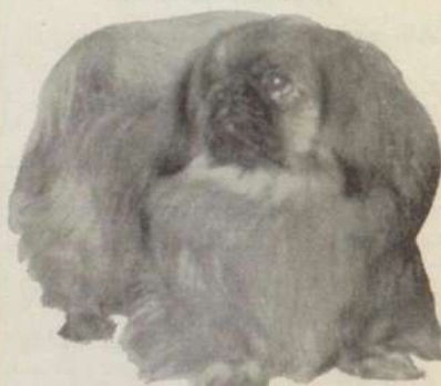
Ch. Su-Roi's Fu Ling

2 times Reserve Best in Show 4 times Best Canadian-bred in Show 15 times Best Toy 21 good reasons why you should enquire about studs, matrons or puppies. We have a few puppies to sell, nice flat faces, good bone, show prospects and valuable breeding stock.