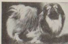
Ch. Suyan's Little Mandarin

330 Dumoulin St., St. Boniface, Manitoba