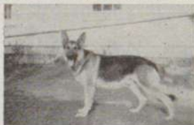
Ch. Major Erich of Marimere