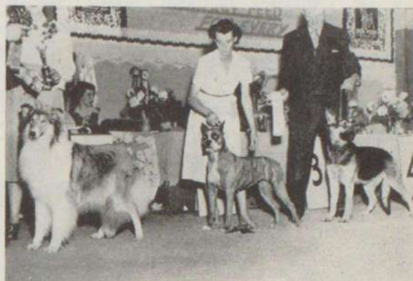
Boxer—Ch. Ballerina of Derrybard