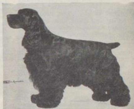
Am. and Can. Ch. Miss Highomar

By Try Cob's Security (Try Cob's Pinefair — Ch. Try Cob's Favour- ite Girl) ex Pinefair Cynthia (Torohill Tirade — Sophie Tucker of Pinefair)