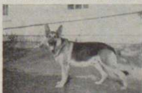
Ch. Major Erich of Marimere