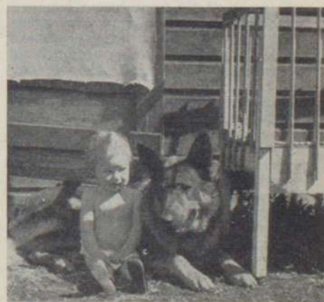
"SULTAN" and baby