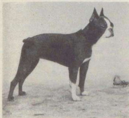
Am. & Can. Ch. Honey's Kewpie Doll

Best of Breed at Miami Specialty — Top Southern Show . . . 1951 record—17 Best of Breed awards (8 American), 6 Groups, and one Best Canadian-bred in Show.