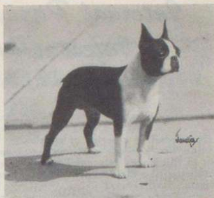
Am. & Can. Ch. Showman's Finale Tommy Canuck