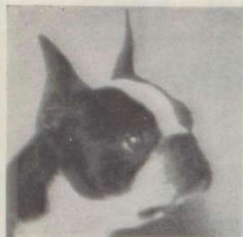
"WATCHIE" Fee: $25.00 (terms)