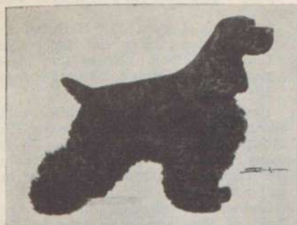
Am. and Can. Ch. Alhambra Kingfish

Wins include Best in Show, Sportsmen's Show, Toronto. Winner of Sporting Groups, Canadian National Exhibition and Sportsmen's Shows, Toronto. Darien and Newark. Best of Variety, Shamrock Specialty Show Houston, Hartford, New Haven, Reading, Rhode Island Specialty, Philadelphia and New Orleans. Best of Winners, American Spaniel Club Specialty Show New York and Westminster. Winners Cocker Spaniel Breeders Club of New England.