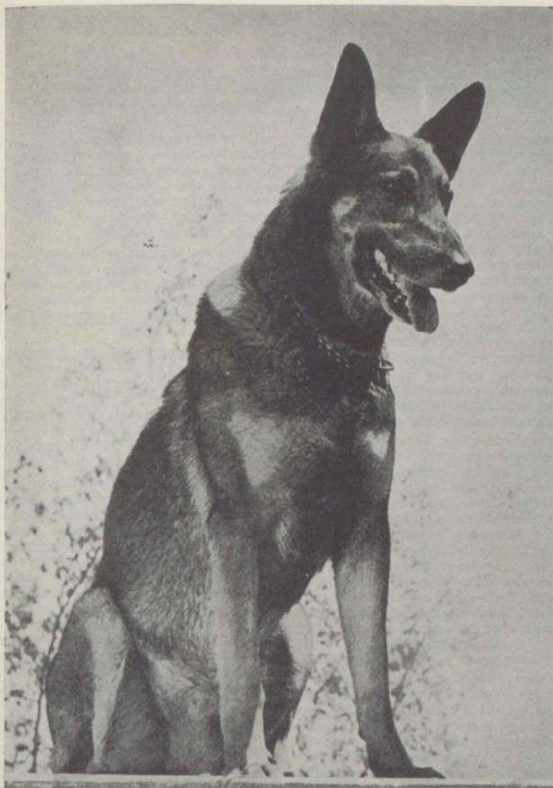
"Smoky", Reg. No. 146U Police Service Dog, retired in August 1951, was relieved of all duties and placed in a suitable home. There he will spend the rest of his life engaging in all the playful antics that duty in the Force prevented.

follow the scent of a criminal through the main street of a city at noon or a three-day-old track of a lost person after the search party admits failure. Yet of the many times a P.S. Dog is called in to assist on a case, the overall picture shows that about 40 per cent of the cases are successful. In the remaining 60 per cent we must remember such instances as—the dog finds the scent of a missing person and just gets nicely started when the person comes out on his own; non-resultant searches where bush areas are searched in the hopes of locating caches of stolen goods, illicit spirits, stills or even articles as small as cartridge casings—are credited as a case for the dog. Throughout the Section this gives a good average but often one dog will show a low average in comparison with a dog in another area. This can be explained by the different types of cases on which the P.S. Dog is most employed in any particular district.