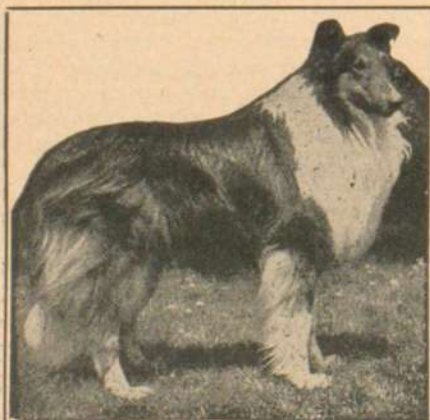
Ch. Bonacres Pickwick At Stud

Suggestion 5 — Why not put some spectator appeal into dog shows? How about this matter of showmanship? I'm sure it's agreed that we want spectators. Do we try to make it an interesting experience for John Q. Public? We make our "poor spectator" wander up and down crowded aisles looking at exhibitors of all sizes, shapes, and descriptions "parked" in front of their prize specimens. At the ringside itself there usually aren't enough chairs. The spectator sees the exhibitors and their animals in the ring. Does he know what is going on? I doubt it. What's the score at any particular time when a class is being judged? No one knows—at times I wonder if the judge knows without a score card. Why don't we devise some sort of a scoring system whereby the judge flashes an objective number for all to see including an official scorer? Why not build up the tension as the dogs are being shown, so that the spectator can really get interested in what is going on? All we do now is have a long pause while the judge moves along. What suspense we create! "Pass the pretzels, Mamie, this suspense is killing me."