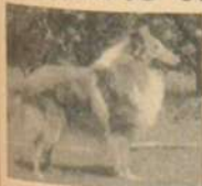
Woodwinds Wendy of Collwood (Sable & White)