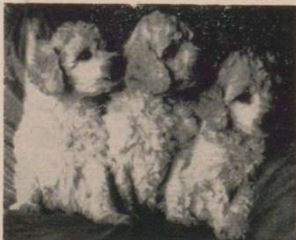
These standard puppies for sale by Ch. Mandarine De La Fontaine

Our kennels provide exclusive poodle clipping, handling and stud service. Breeders of fine toy and standard puppies.