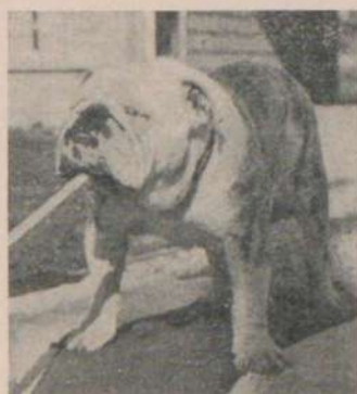
Ch. Len-Mar Duke of Derbyshire