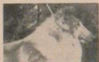
Woodwinds Wendy of Collwood (Sable & White)

"Wendy" was sired by Am. Ch. Sir Chips of Arken and is ex dau. Duskywood Diane of Arken.