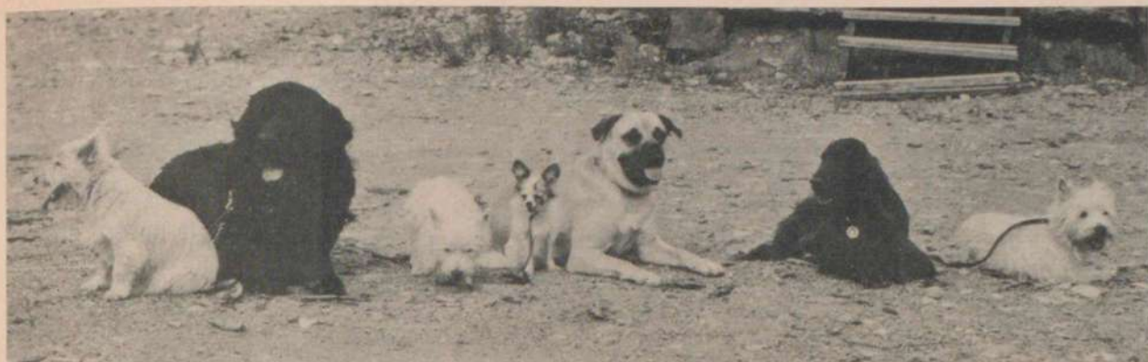
Four Rouge dogs and an Irish friend from Duluth spent a week this summer as the guests of Newfie "Bozo" and Westie "Fons" in a lumber camp near Caramat, Ont. We publish the above as a tribute to the good manners of all the dogs concerned.