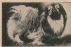
Ch. Suyan's Little Mandarin

SUYAN'S PEKINGESE KENNELS Stud Service Puppies for Sale