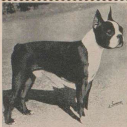
Ch. Puffer's Ace of Perfection C.K.C. 311723 A.K.C. N.138885