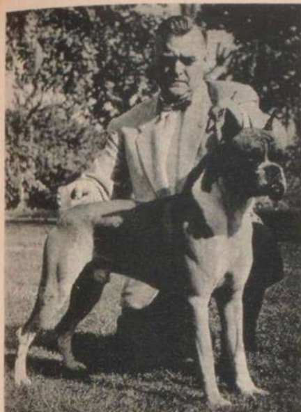
Ch. Dominion Fortitude of Glen Echo