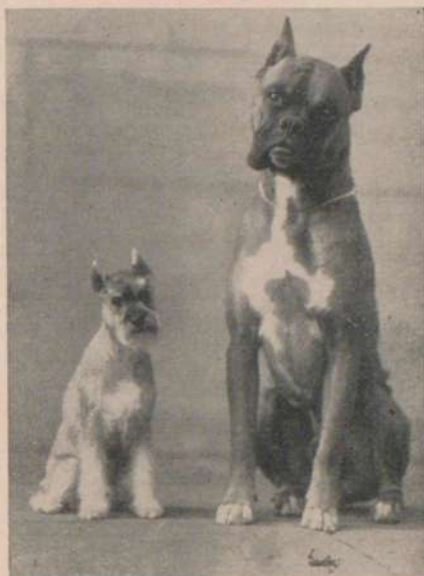
"Sugar Plum" and "Pantywaist"