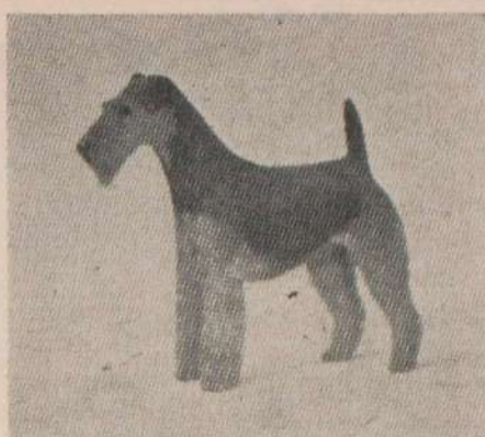
Dales Queen of Greeba

Scottish, Welsh, Lakeland, Wire Fox Terrier Pups for Sale