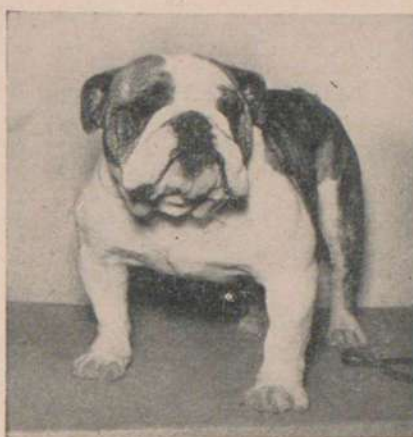
Ch. Nugget Treacor