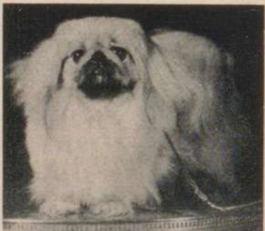
YU BEE OF WANGZA

Sire: Ch. Sanell Yu Bee Tu ex daughter of Ch. Yu Chuan of Wangza Fee $40.00