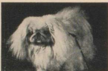
SANELL HAI PUFF OF ACOL (imp)

Sire: Puff Ball of Chungking ex litter sister to Ch. Tong Tuo of Alderbourne Fee $50.00