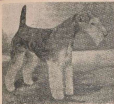
Can. and Eng. Ch. Greeba Crummock Confidence