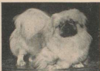
SANELL YU BEE TU (imp)

Sire: Sanell Buzz Bee by Ch. Yu Tong of Alderbourne ex daughter of Yu Tuo of Pedmore Fee $50.00.