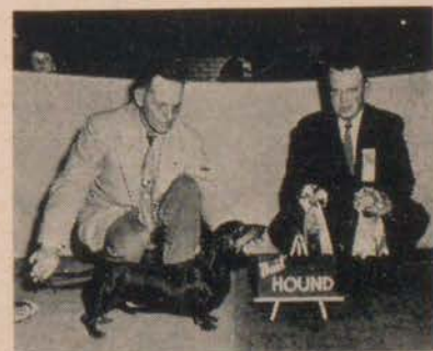
Ch. Tag-A-Long's Fritzie