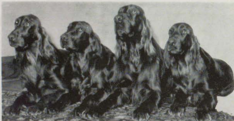
"Challie", "King", "Pride" and "Bunty"

We are proud to present here our dogs of today which we believe to be on a par with those owned by the best kennels in the United States and the Old Country, and we are also proud of the many friends we have made through our dogs. Were it not for those grand people, the "dog game" would undoubtedly lose much of its thrill. The past 25 years have gone quickly but we have enjoyed every moment of it. Our dogs are our pleasure.