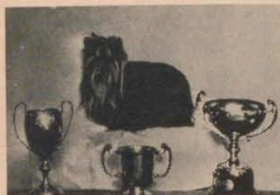
Ch. Belziehill Tom Thumb

Champion Wonder Boi started at the Vancouver Exhibition Show September 3rd, 1954 and completed his championship at Victoria City Kennel Club, November 13th, 1954.