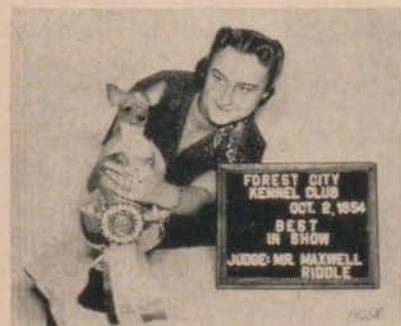
Int. Ch. HOGAN'S AMIGO