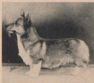
Champion Macksons Coronet

Coronet finished for her championship at nine months, was Best of Breed at five shows, has won one second, two thirds and one fourth in group and five times Best Canadian Bred Puppy in Group. Her Dam, Ch. Kaydons Double Talk also owned and campaigned by us, finished this year and her Sire is Am. Ch. Kaydons Anthony, son of Int. Ch. Lees Symphony. Coronet will be campaigned shortly in the U.S.A.