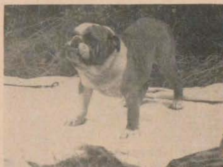
Int. Ch. Duway's Marquis of the Hill