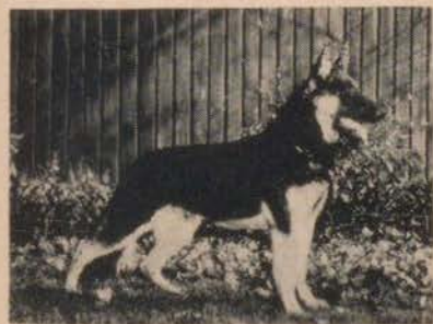
CH. SULTAN OF OAKMERE

Sultan won his championship with two 4 and a five point show. He is a son of champion Rickey of Oakmere, a Best in Show dog and grandson of champion Major of Northmere, the first Canadian bred and owned dog to win the title of Grand Victor, the highest honour accorded a German Shepherd Dog in both the United States and Canada. Sultan is but one of the many fine Shepherds bred in the Oakmere Kennels.