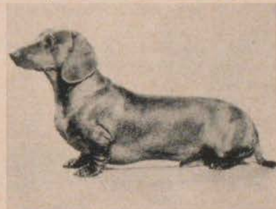
Ch. Bareena's Dirk Von Sonnenberg

Ch. Dirk Von Sonnenberg received his award of champion before he was a year old, starting his career in the show ring at seven months of age. He won the award of Best Canadian Bred Puppy in eight shows and Best in Group, at the same time he was winning the points towards his championship. His show career is just beginning, as he is now ready to go "out" in Specials in 1955. His famous Sire, Ch. Dirk of Gera, and Dam, Ch. Chicopee's Patric, should be an inspiration to him.