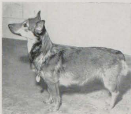
Red Princess, C. D.

Born July 21st, 1949, - Died Tuesday, January 18th, 1955