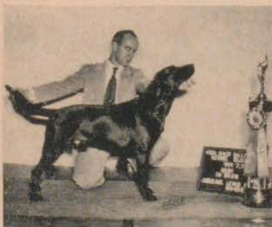
Can. and Am. Ch. Dark Star of Franklin

Ch. Wildair Celebrity made her championship in five straight shows (three weeks) winning five Winners, four Best of Winners, one Best Opposite Sex and three Best of Breed. She is the winner of two Irish Setter Club of Canada awards, for Best of Breed and Champion Female. Ch. Wildair Celebrity is sired by English and Swiss Champion Storm of Casamia and her Dam is American Champion Red Mollie of Devon (see full page advertisement this issue).