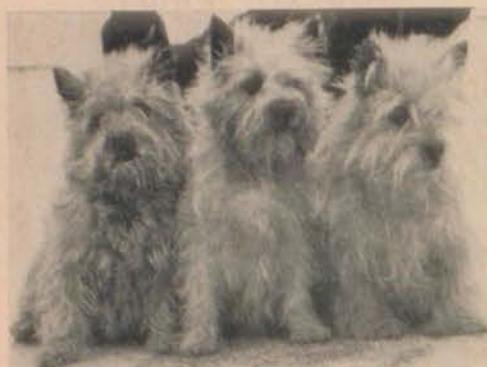
Three generations of international champion Cairn Terriers. The 14½ year old Tam's Grey Girl of Cairndania with her daughter Kilmot's Holly of Cairndania and granddaughter (in centre) Cairndania McTavish's McPol (who is one of our 1954 International Champion).

In Cairn Terriers our record to date is: