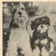
BLACK & SILVER ● SALT & PEPPER

Show and Companion PUPPIES bred from Obedience Trained Champions . . some housetrained, all loving and gentle.