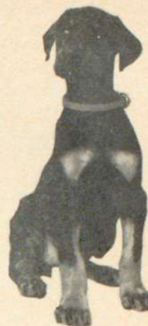
"Sheri", Alarich/Lisa dau. pictured at 7 1/2 weeks.

297 Grenville Ave., Thunder Bay (Port Arthur) Ont. 807 - 683-6803 or 807 - 683-3277