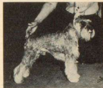
Can. & Am. Ch. Jonaire Pocono Gladiator