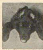
"Rarin To Go"

Dogs in Canada 200 Davenport Rd., Toronto 5, Ont.