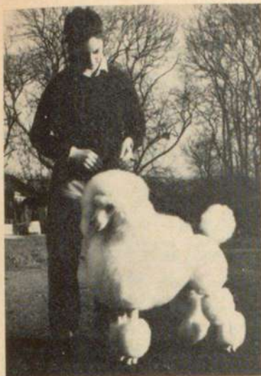
SPRINGETT PARK QUITE THE LADY OF BIBELOT